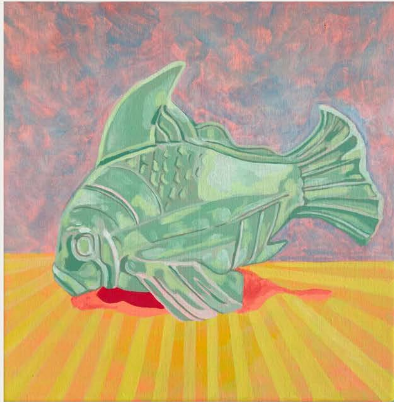
Mrs Fish 20x20cm oil on canvas 350