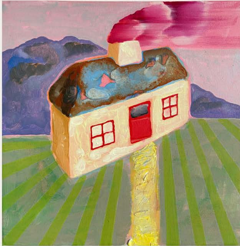
Turf house 20x20cm oil on canvas 350