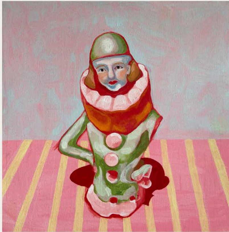
Clown 20x20cm oil on canvas 350