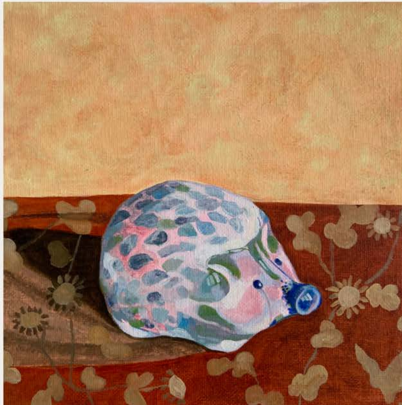
Carpet hog 20x20cm oil on canvas 350