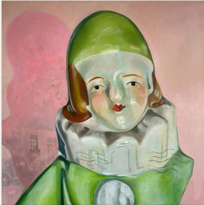
Mrs Clown 40x40cm oil on canvas 950