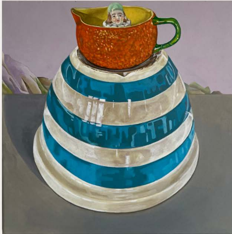
Tower 30x30cm oil on canvas 700