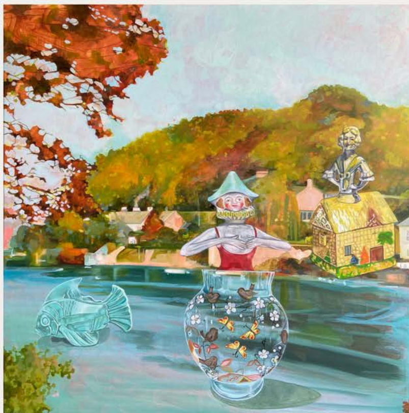
Lady's well 60x60cm oil on canvas 1450