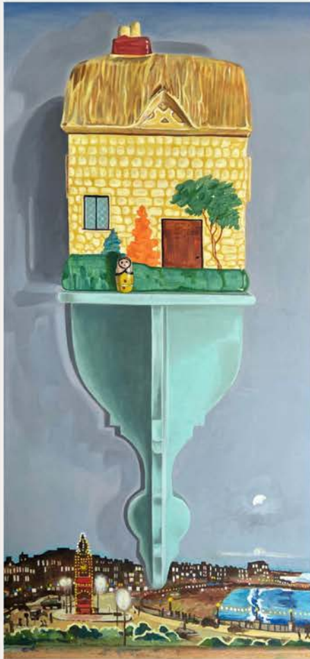
Stepping out at Margate 30x60cm oil on canvas 950