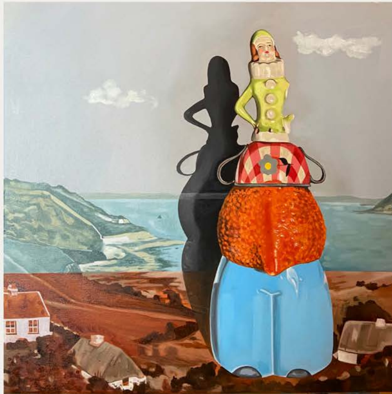
In the pink 40x40cm oil on canvas 950