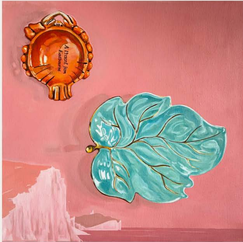
A present from Eastborne 30x30cm oil on canvas 700