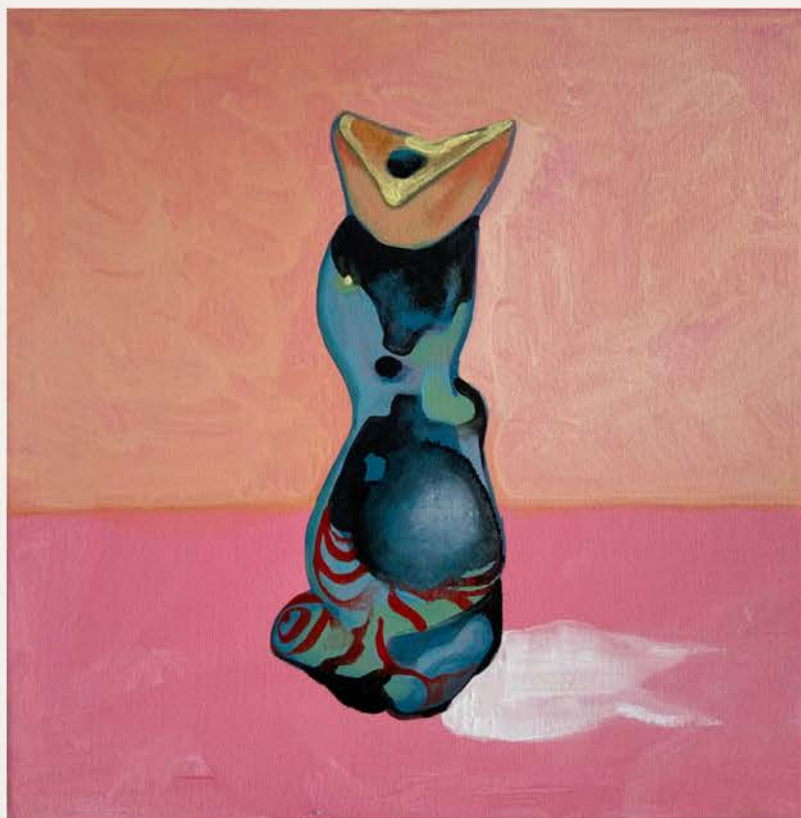
Mrs Birdpie 20x20cm oil on canvas 350