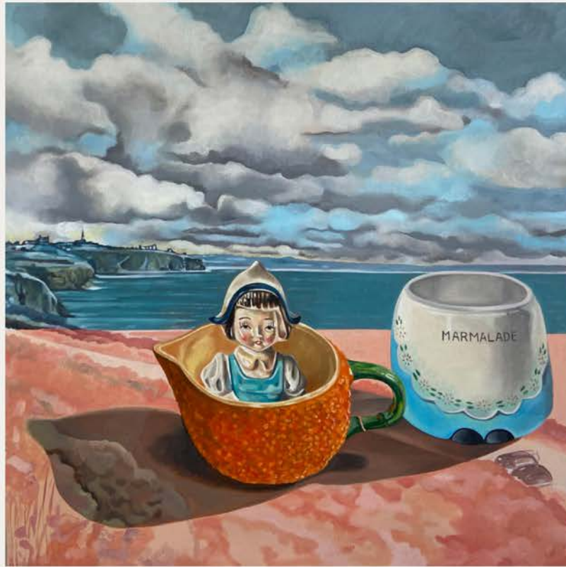
Miss Marmalade 40x40cm oil on canvas 950