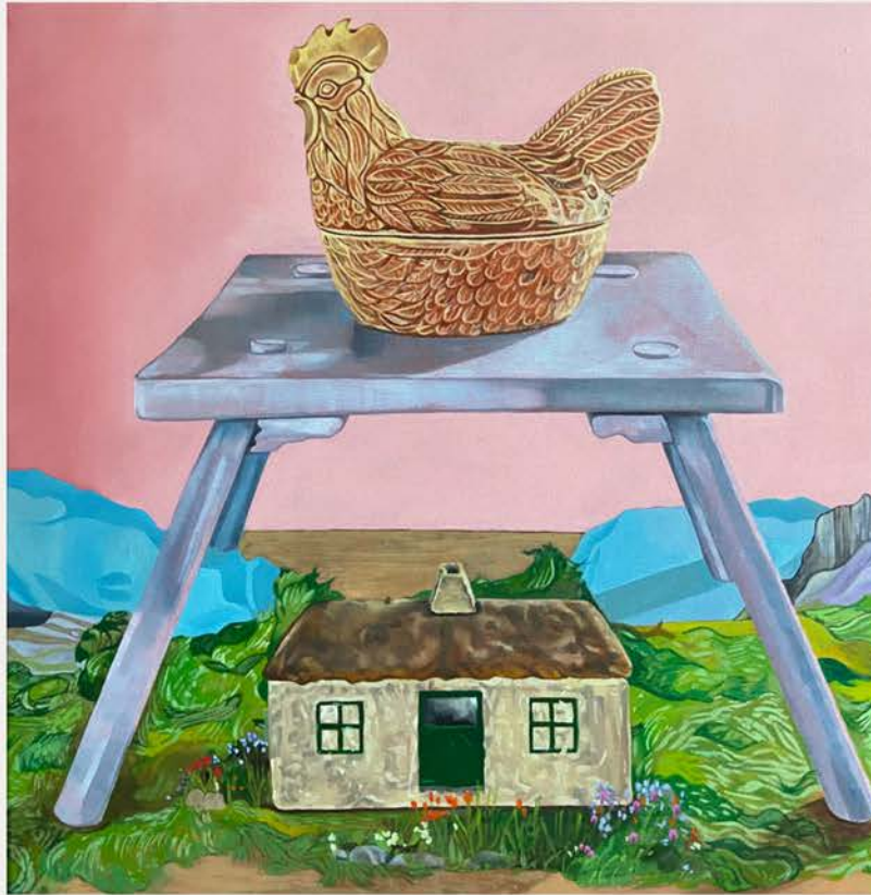
Hen House 40x40cm oil on canvas 950