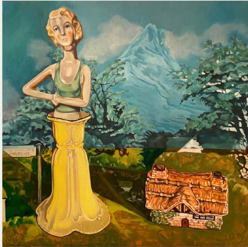
Lady Rushlight 40x40cm oil on canvas 950