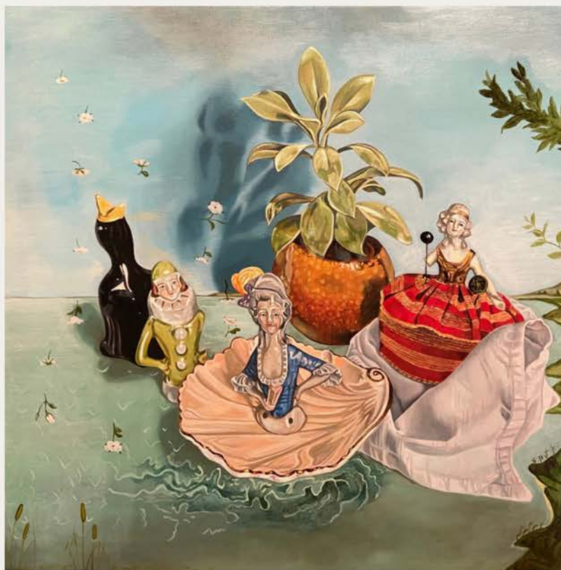
Porcelain pond 40x40cm oil on canvas 950