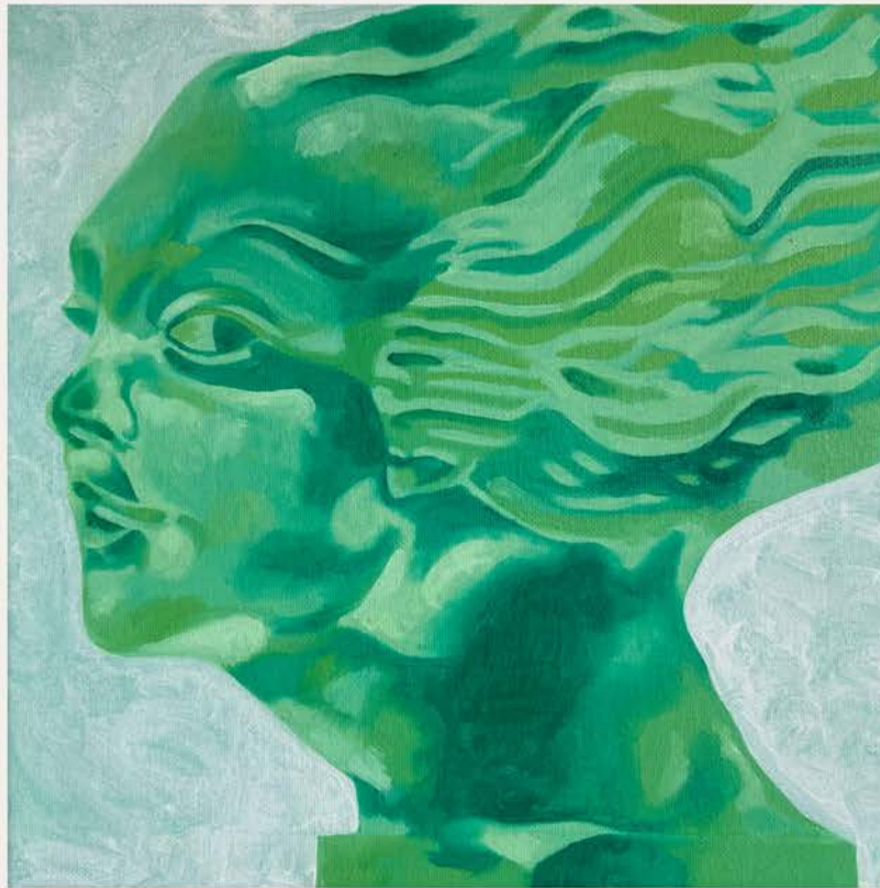
Mrs Vaseline 20x20cm oil on canvas 350