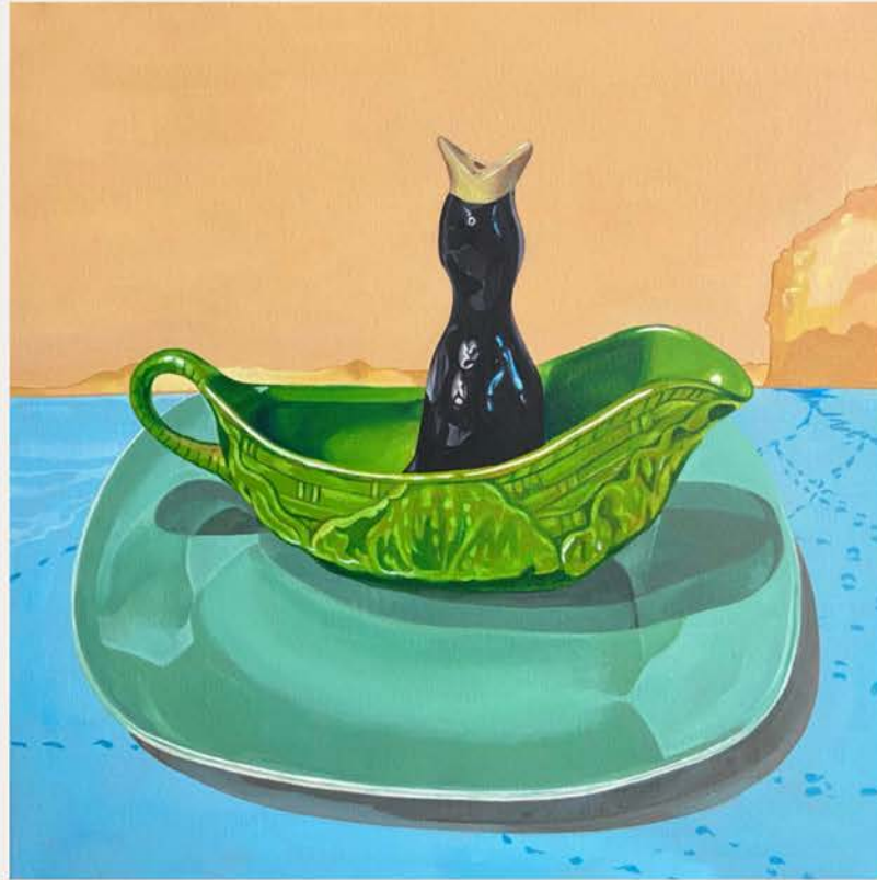
Mrs Pie 30x30cm oil on canvas 700