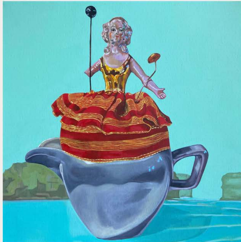
Mrs Stitch 30x30cm oil on canvas, 2022 700