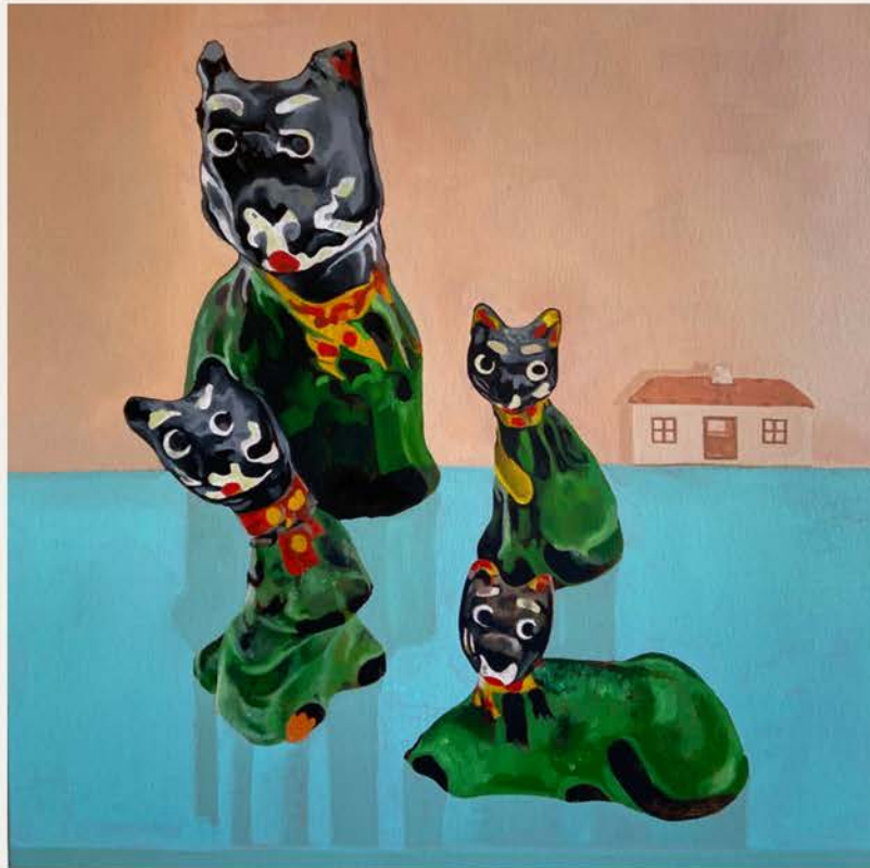
Cat family 30x30cm oil on canvas 700