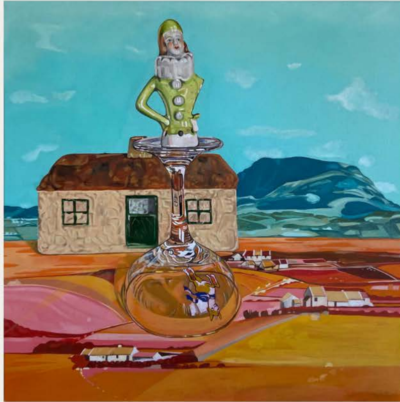
Mrs Babycham 40x40cm oil on canvas 950