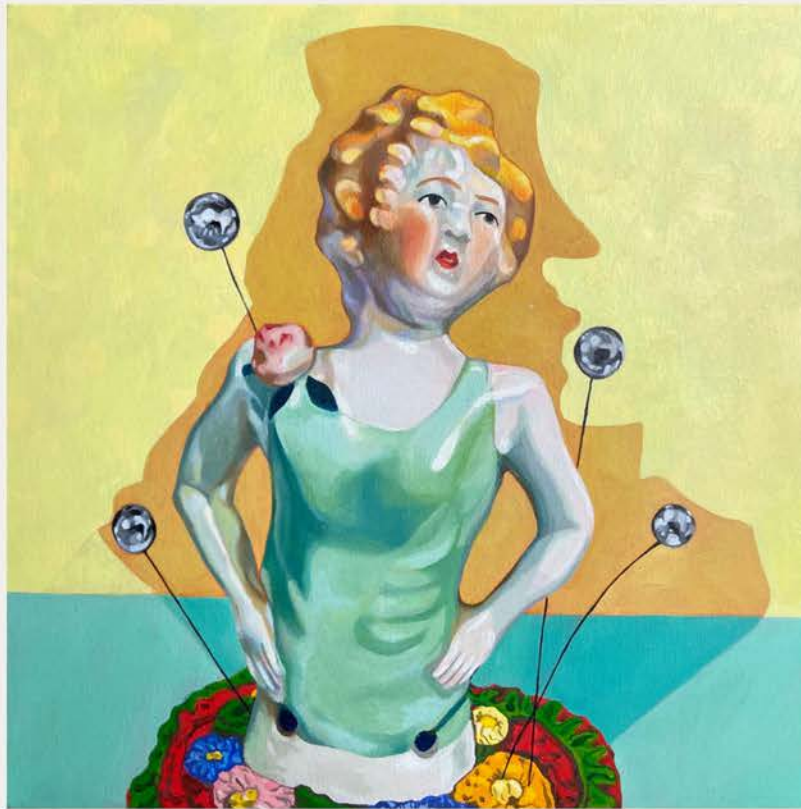
Ms Stitch 30x30cm oil on canvas 700